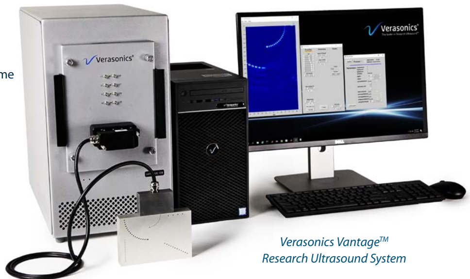
Verasonics Vantage ™ Research Ultrasound System